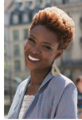
Rokhaya Diallo @RokhayaDiallo Journalist, Writer, and Filmmaker