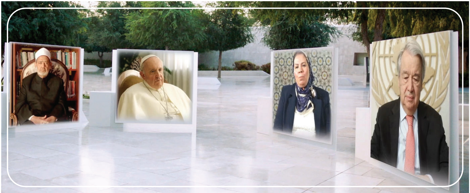
Conversation between the 2019 honorary recipients and 2021 honorees during the virtual award ceremony in 2021.

Their Majesties King Abdullah II ibn Al Hussein and Queen Rania Al Abdullah of the Hashemite Kingdom of Jordan, alongside the Haitian humanitarian organization the Foundation for Knowledge and Liberty (FOKAL).