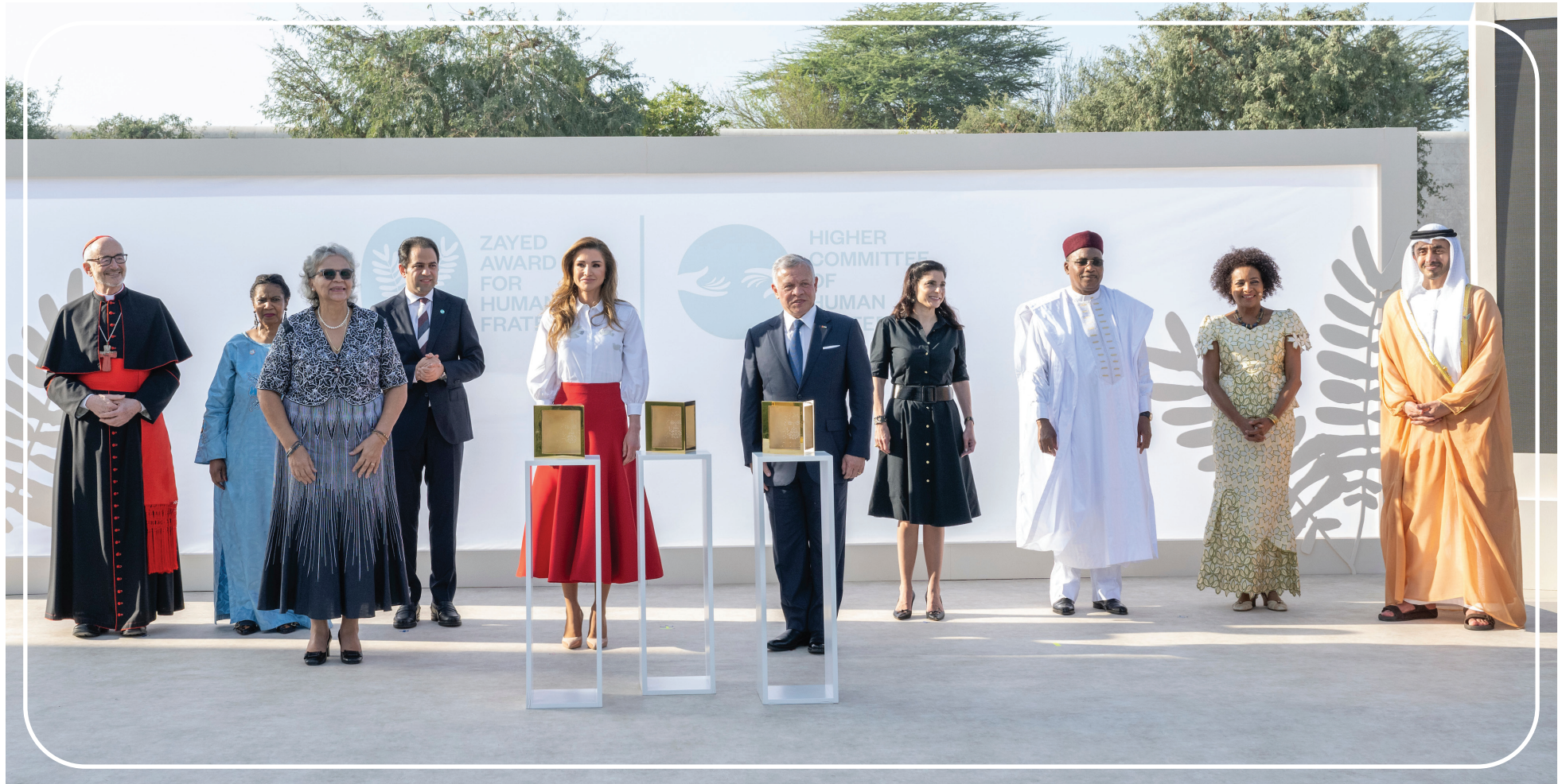
The 2022 honorees and 2022 Judging Committee together with His H.H. Sheikh Abdullah bin Zayed Al Nahyan, UAE Minister of Foreign Affairs and International Cooperation, during the 2022 private award ceremony in Abu Dhabi, UAE.