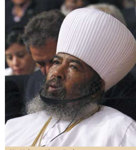
His Holiness Abune Paulos Patriarch of the Ethiopian Orthodox Church

The vast majority of people are not aware that religious leaders assemble in this way. It is important to raise the profile and visibility of exchanges such as this one. But the issue at hand is more than a matter of public relations. The misperception that religion is the root cause of violence needs to be dispelled. Engaging voices that represent the peaceful, mainstream of religions is essential, as ignoring them allows extremists to fill the void left by their absence. Thus, religious leaders have a necessary role in the promotion of shared security. In that respect, it was suggested that a future theme for the AoC Clearing-house should be the collection of best practices in the engagement by religious leaders and communities of other key sectors, including the corporate, political, and media sectors for the purposes of advancing development, humanitarian action, and positive social change.