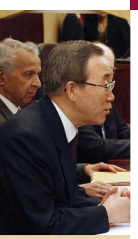
H.E. Mr. Ban Ki-moon, UN Secretary-General

Others underlined the important role of cultural programs in promoting economic development. Such programs enjoy high rates of return and can help generate employment opportunities as well as economic benefits.