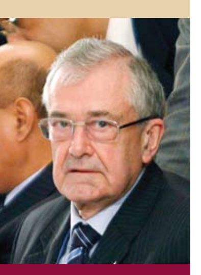
Cultural diversity is something to be enjoyed. It is not a problem. The problem is ignorance. It is ignorance that provides the fuel for fear, prejudice and hate.