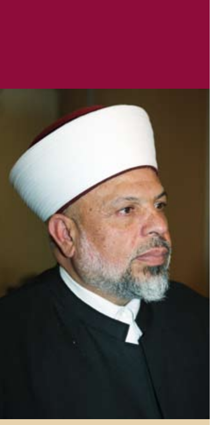
H.H. Sheikh Tayseer Al-Tamimi of Palestine

Participants also recognized that to expand shared security, disparities in income, allocation of resources, and various other inequities also need to be addressed. The dynamics of globalization have further cemented many of these problems. Shared security cannot be achieved without working toward global justice. Engagement from multiple sectors and stakeholders is thus necessary to make progress.