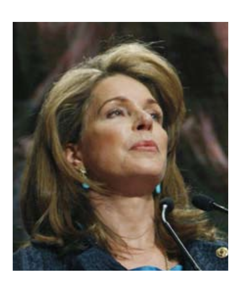
In truth, in our hearts and souls – in what we fear, in what we seek, in what we need and what we love – there is a fundamental common humanity that towers above our differences.

She further announced that leading Hollywood and new media companies, including Participant Productions, International Creative Management, Summit Entertainment, and YouTube have already committed to support the Alliance of Civilizations Media Fund.