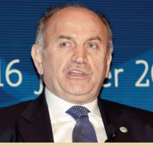
Mr. Kadir Topbaş, Mayor of Istanbul

During the session, mayors questioned the supreme role of national governments and their potential to bring about tangible improvements to people's lives. They agreed that states alone cannot generate change. Rather, we need to look at the positive role that civil society and local authorities can play. Local schools where children are taught about the need for tolerance and understanding, and local youth clubs where they learn about other cultures are both prime examples of instruments of mobilization. Involving a few dedicated individuals within a certain community could have a very empowering and positively transforming